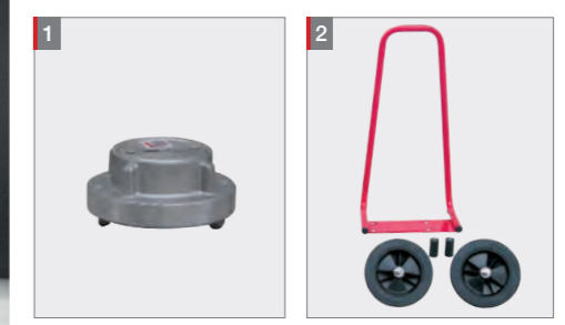
• Hose closure size C with automatic vent valve. • Attachable mobile base parts, approx. 4 kg.