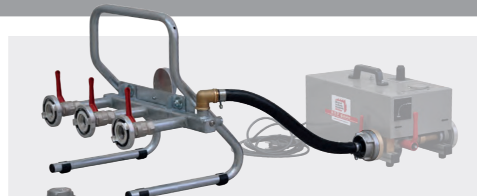
• Art.-No. 186588 Manifold for simultaneous pressure testing of up to 3 fire hoses, floorstanding model, max. 16 bar.

Motor and air heater are protected by a galvanized and coated sheet steel housing. A 5 m cable and cam switch supply the power.