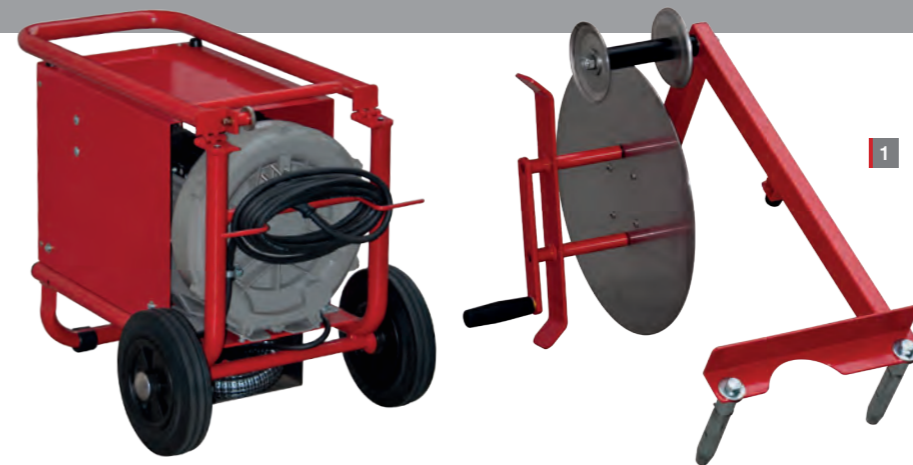
1 Art.-No. 187215 Plug-on hose winder for hose drying device STG (surcharge)

Plug-on hose winder for fire pressure hoses, for attachment to the hose drying device STG.