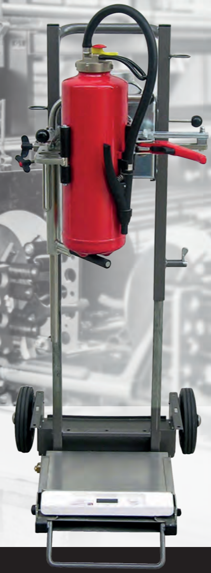
• Mobile rotatable clamping device DSV MOBIL with accessories.